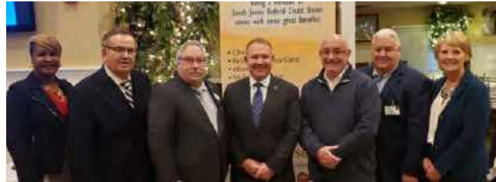
SJFCU joined Cape Regional Foundation, Cape May County business leaders and public officials at the “Building a Healthier Business Community Forum.”

In pre-pandemic February, SJFCU was the presenting Sponsor of the Cape May County Regional Chamber of Commerce “Building a Healthier Business Community Forum” in conjunction with the Cape Regional Foundation. Attendees learned how Adverse Childhood Experiences have a direct impact on long-term workforce development.